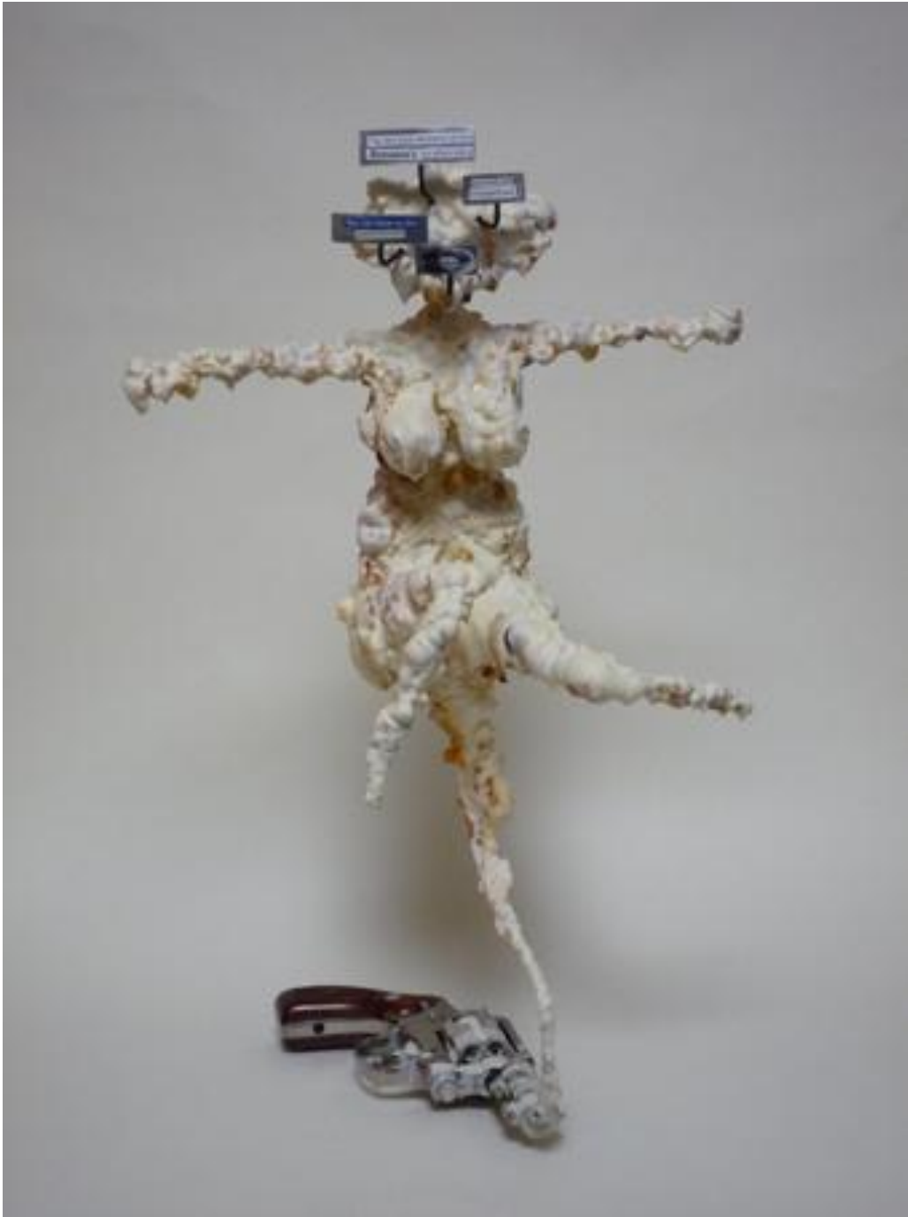
White Lady #5 (guns / the best moment) mixed media 53x32x25cm 2009