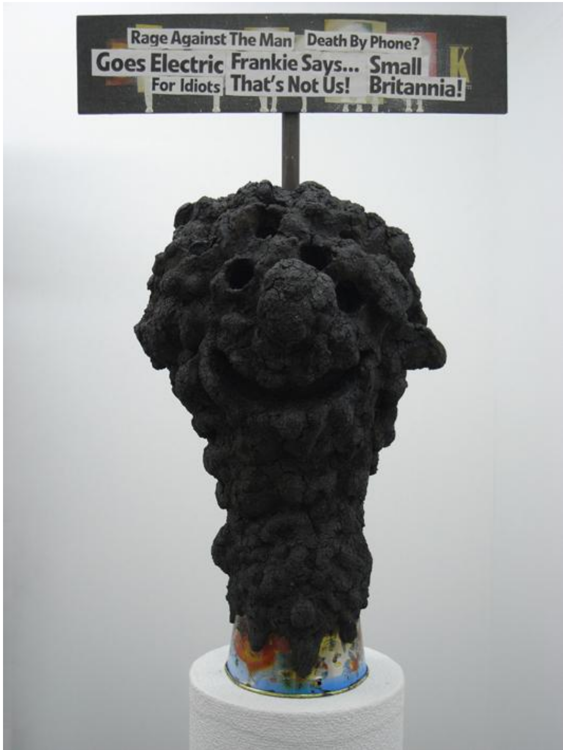
Gold Fish (Rage Against the Man.) mixed media 63x42x30cm 2008