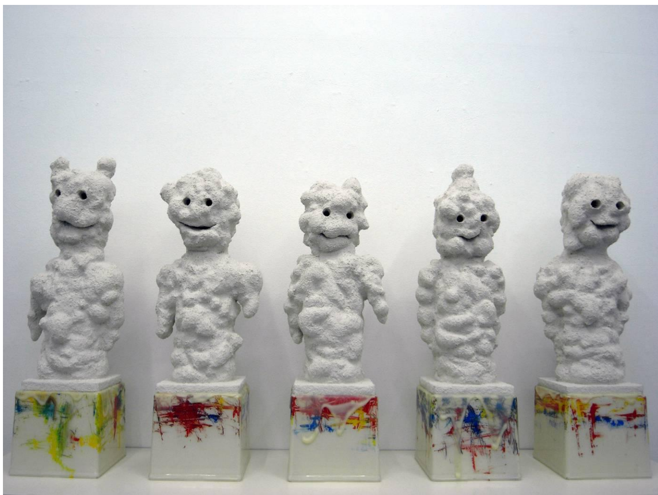
St.G.H.I.J.K (white saint) mixed media 65x36x27cm each 2008