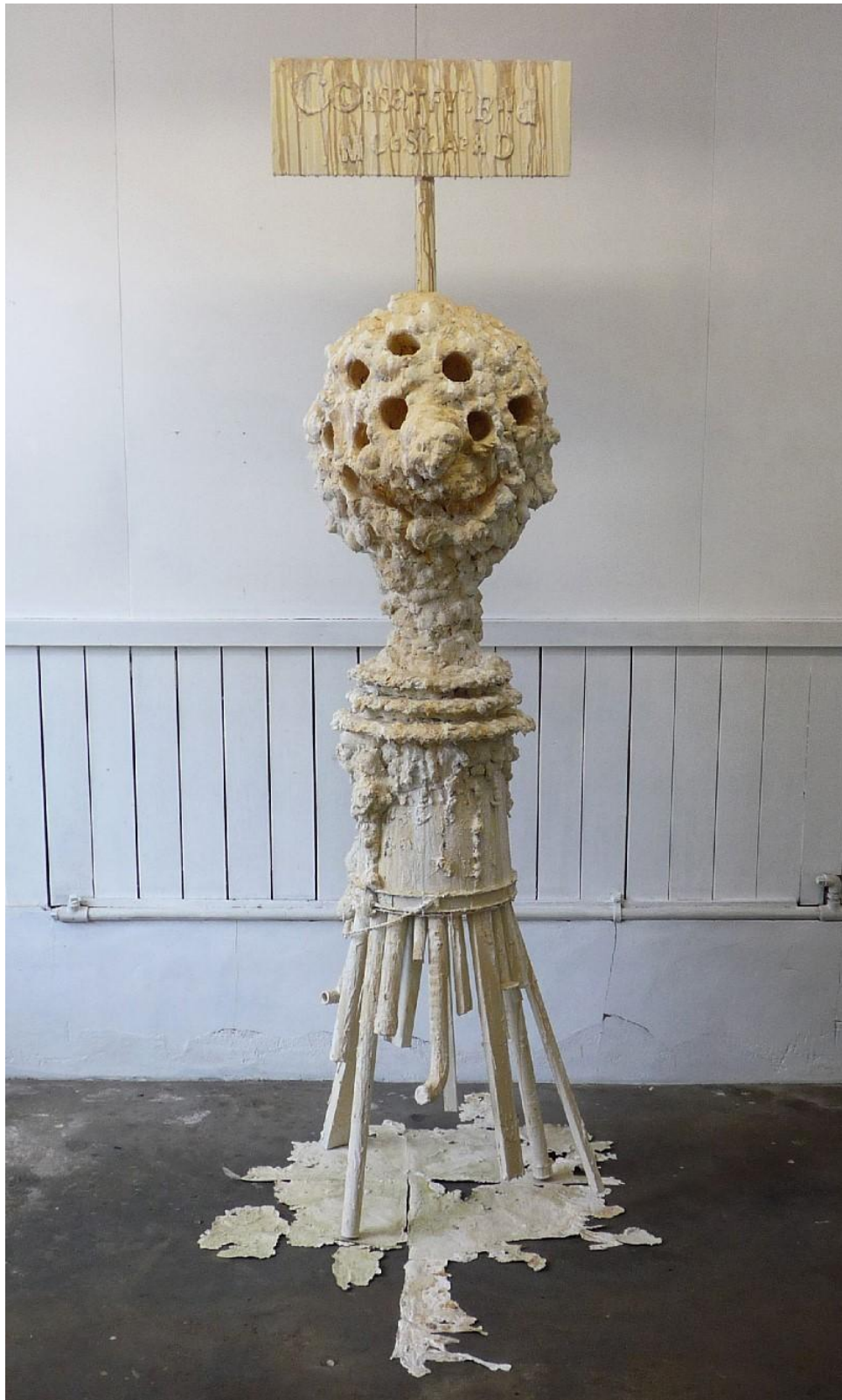
Smiling White mixed media 210x52x60cm 2011