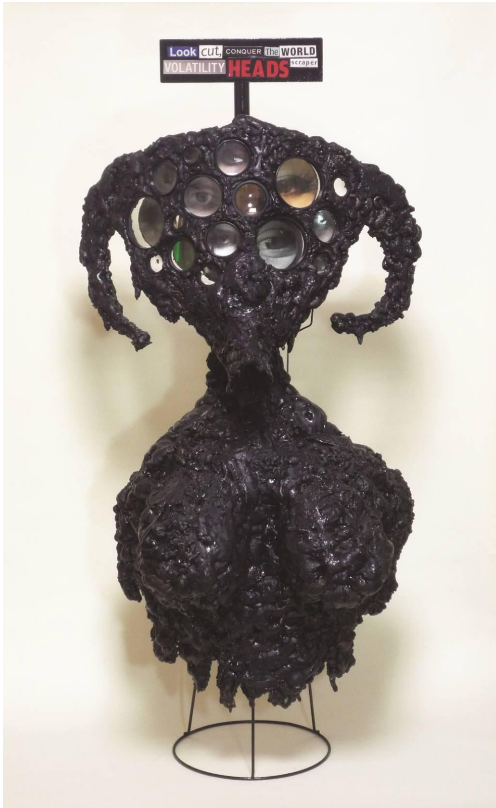
Black Looker No.1 (lenses/Look cut, conquer) Lenses, silicon, polyurethane, magazine, steel, wood, paint 110x46x38cm 2009