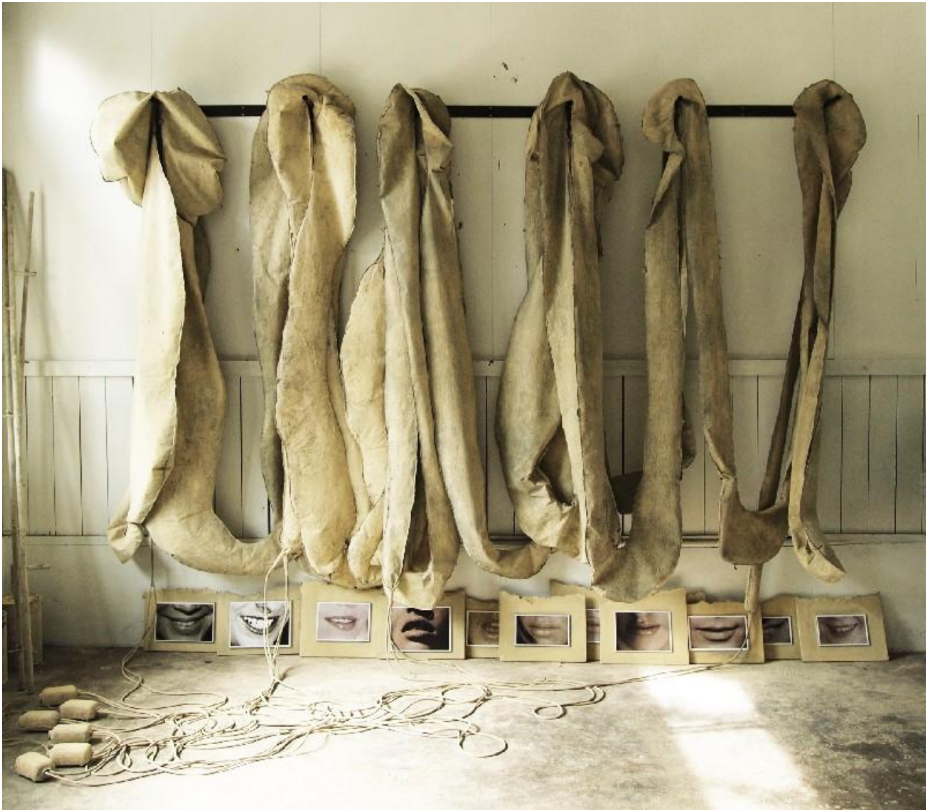
Medusa (balloon works #2) mixed media 210x270x170cm 2012