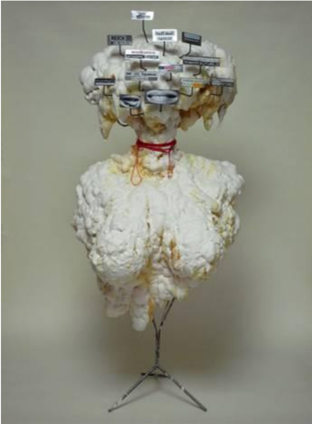
White Lady #4 (magazines / go to the party) mixed media 96x45x30cm 2009