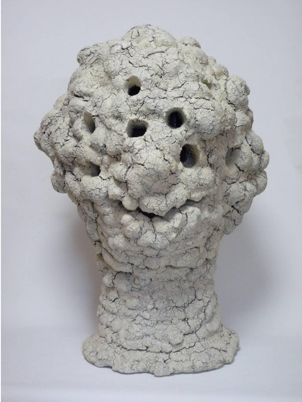
Untitled (whit head) Mixed media 70x50x55cm 2008