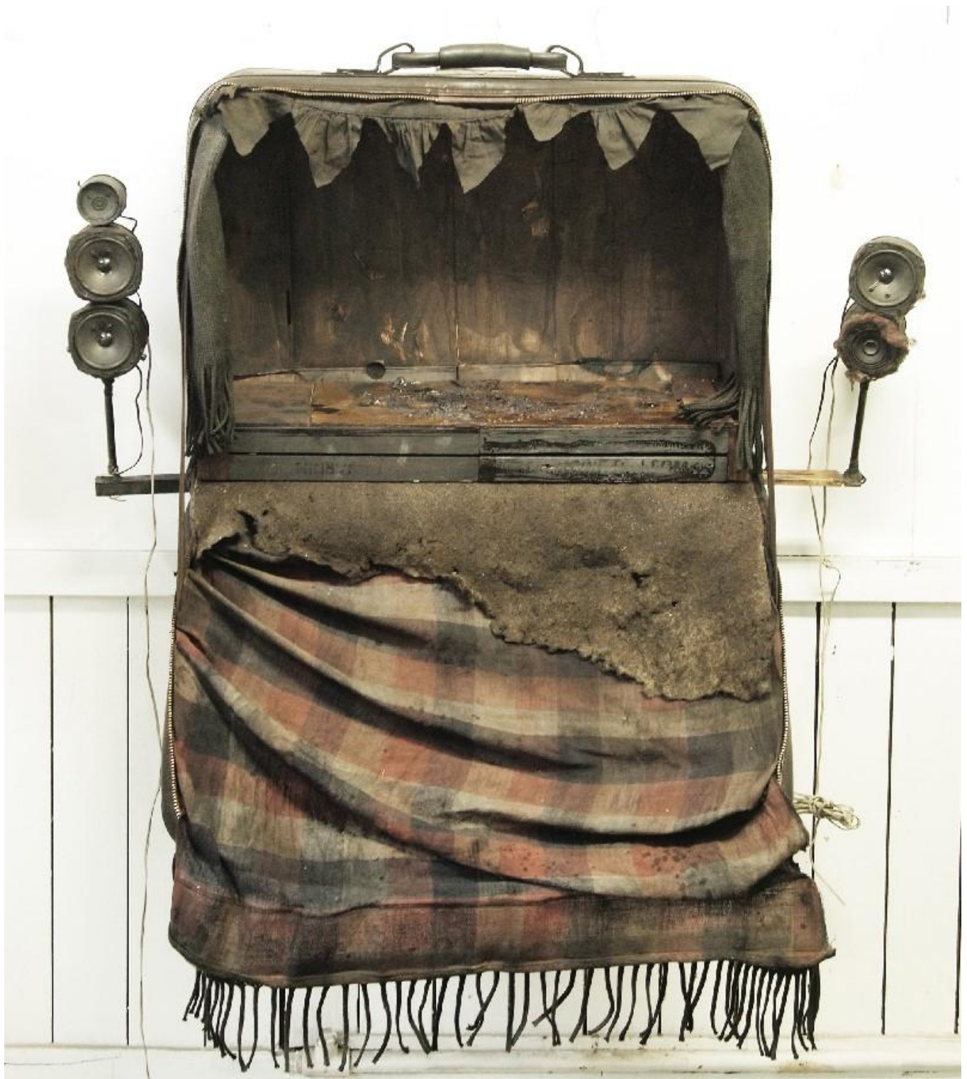
stage / right and left mixed media 140x100x55cm 2014